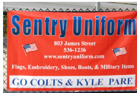
3' x 5' Banner

YES! I would like to help the Chicopee Comp Colts!